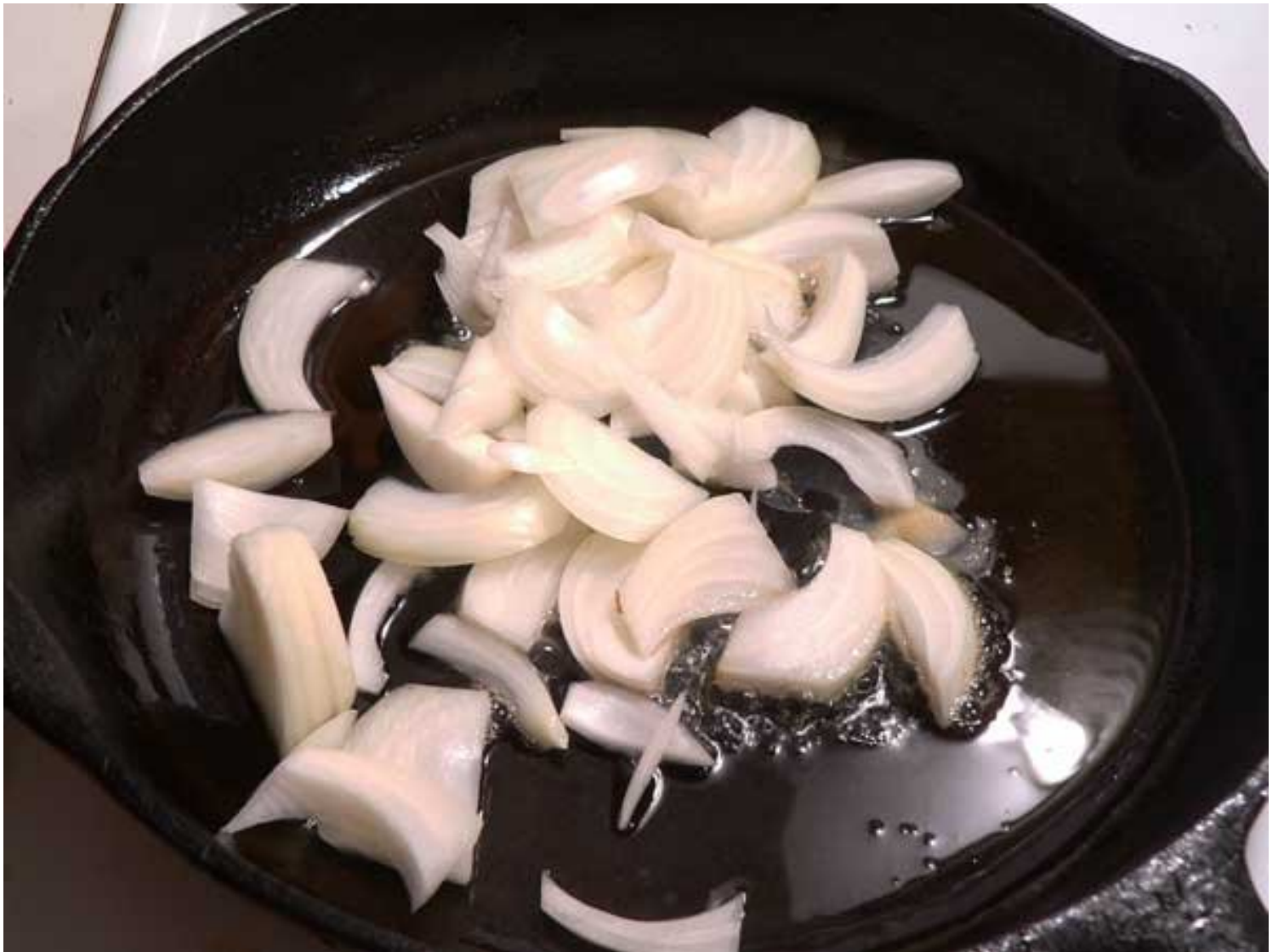
Add the sliced onions to the skillet.